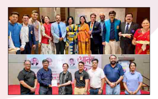
Award for club with Highest registration. The Dist. Assembly "Anand Adhiveshanam" at Vadodara on 6th & 7th May 2023.